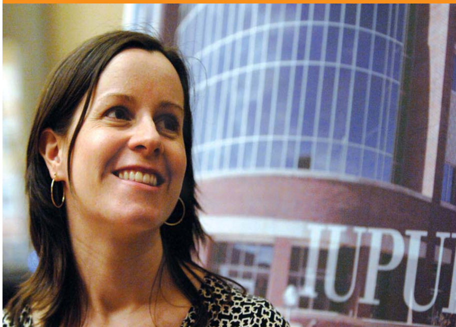
Exhibit and Sponsorship Prospectus

The Westin Indianapolis ~ Indianapolis, Indiana October 25—27, 2009